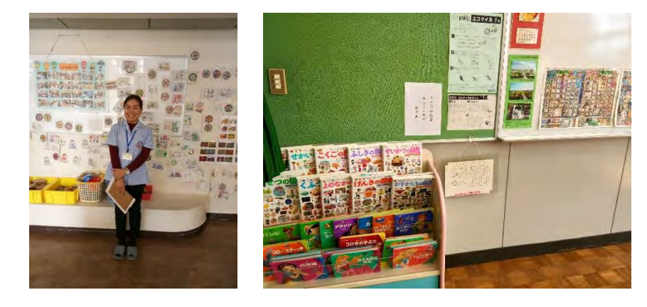
Pictures of participated in the community base program for mothers and children in Nishinomiya City

I have a chance to participation in the community base program for mothers and children in Nishinomiya City. Nishinomiya City is located on the south-east of Hyogo Prefecture. It is located midway between Osaka and Kobe. It has been developed as an "Educational living district" by taking advantage of convenient location and rich natural environment. Many Population in this area move from the other prefecture. Almost people has a nuclear family and do not know other family. This program provides for helping mother and child to meet and play with other people. This place also has many toys, books, music instrument to stimulate child developmental. This place also has staffs that can help, take care, share the information, giving child care education and mother can talk and release their stress.