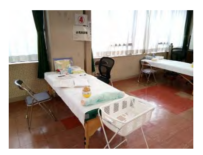
Pictures of 4-month baby health checkup provide by community health center

I have a chance to participation in the community base program for mothers and children in Nishinomiya City. Nishinomiya City is located on the south-east of Hyogo Prefecture. It is located midway between Osaka and Kobe. It has been developed as an "Educational living district" by taking advantage of convenient location and rich natural environment. Many Population in this area move from the other prefecture. Almost people has a nuclear family and do not know other family. This program provides for helping mother and child to meet and play with other people. This place also has many toys, books, music instrument to stimulate child developmental. This place also has staffs that can help, take care, share the information, giving child care education and mother can talk and release their stress.